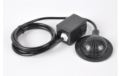
Foot Pedal Air Switch